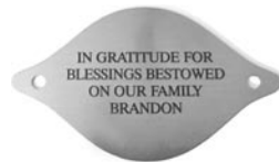
Sample of an Engraved Leaf